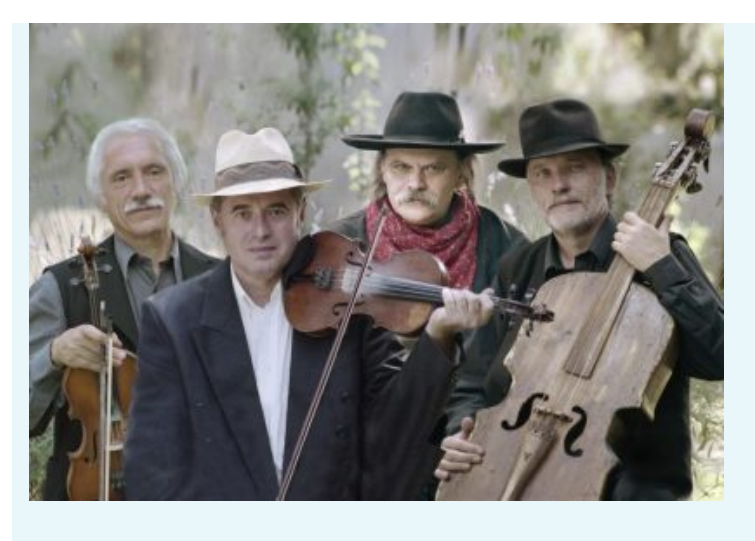
Muzsikás – Hungarian folk music ensemble