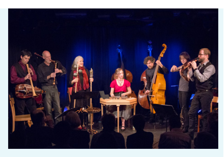
Tritonus – Swiss folk music ensemble