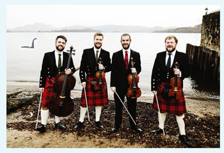
The Maxwell Quartet