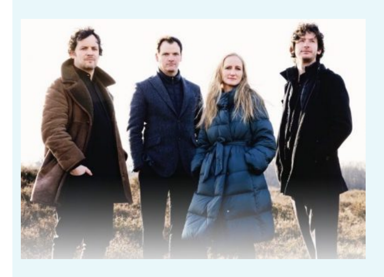
The Navarra Quartet